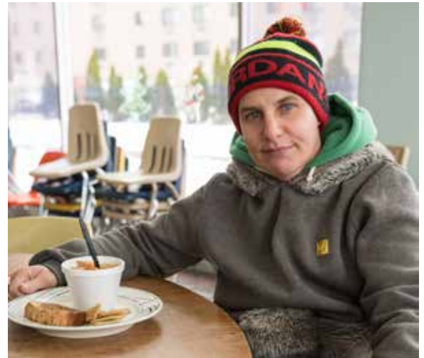
Pillar of Hope partners make it possible to provide nutritious meals and so much more.