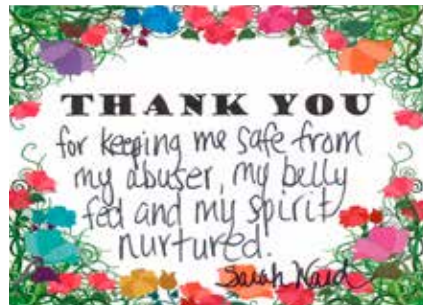
Cherry Street guests THANK YOU ...see more on page 5.

Voice of Compassion is a publication of: